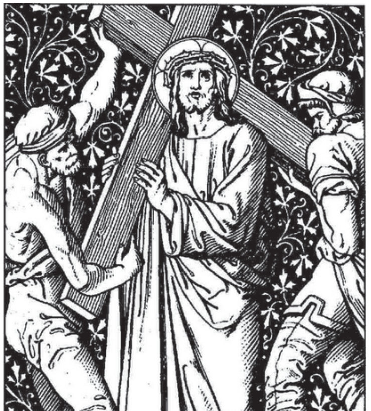
According to St. Alphonsus Liguori